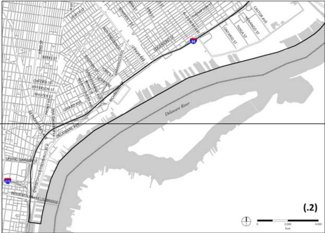
Delaware River Waterfront Parking for "Sit-Down Restaurants and "Nightclubs and Private Clubs" (Only applies to commercially-zoned lots)