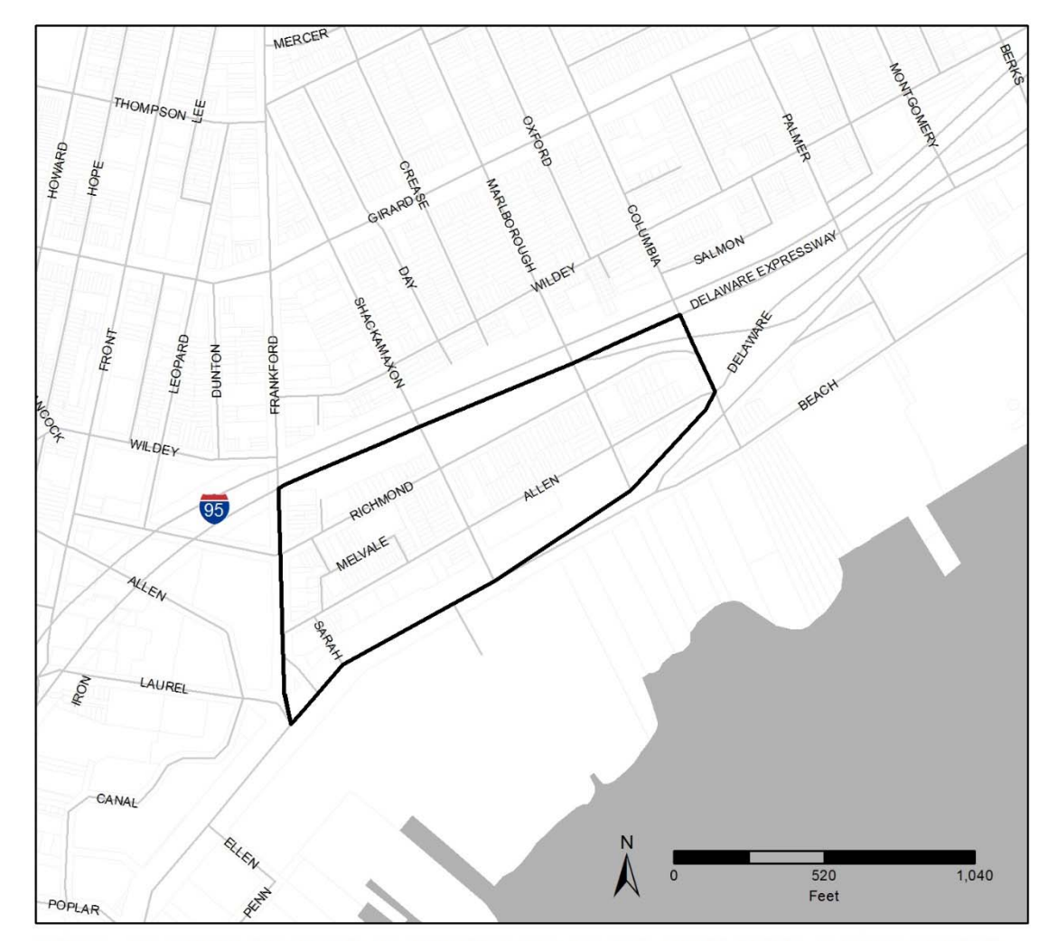
Delaware River Waterfront Parking for "Sit-Down Restaurants" and "Nightclubs and Private Clubs" (Only applies to commercially-zoned lots)