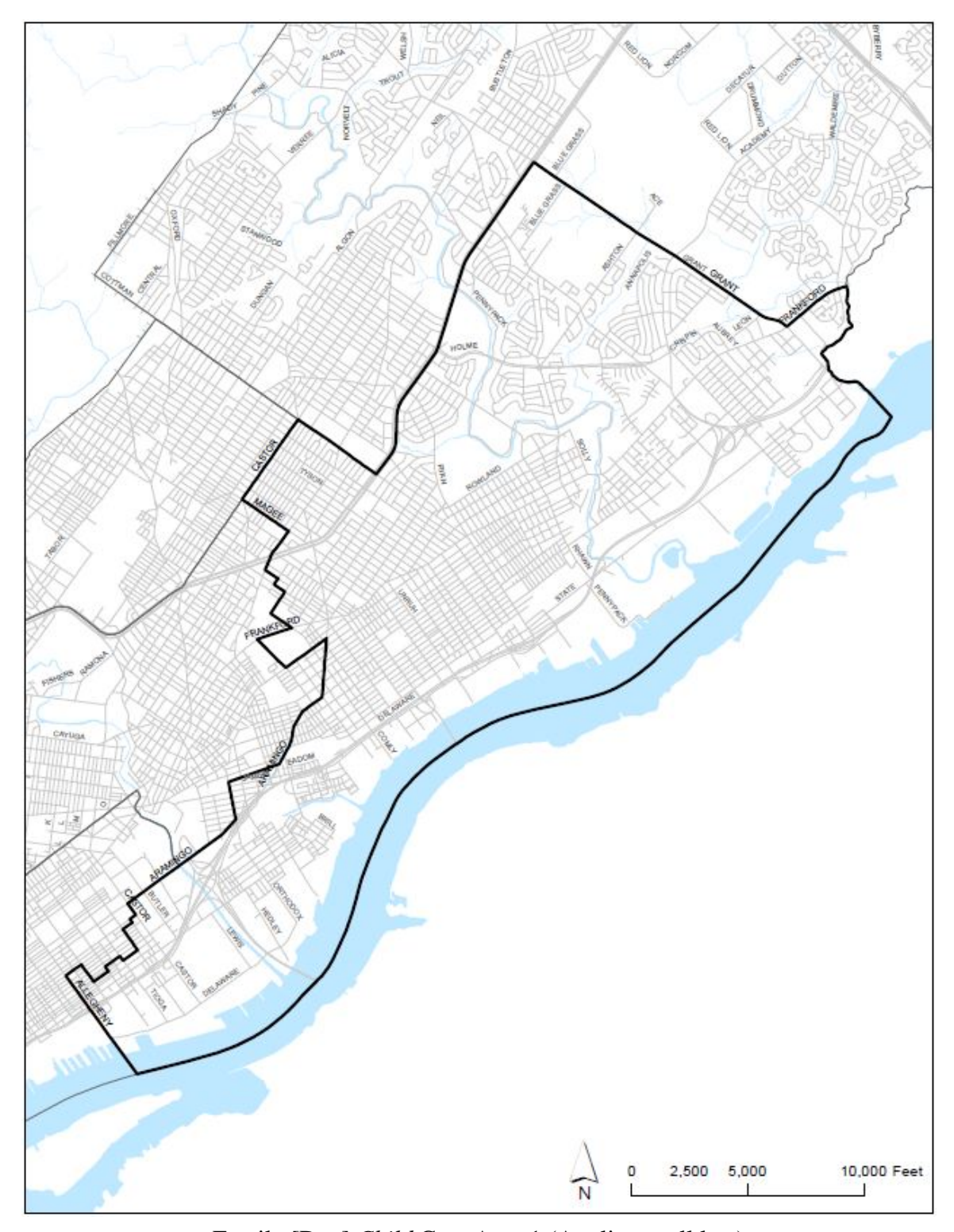
Family [Day] Child Care Area 1 (Applies to all lots)