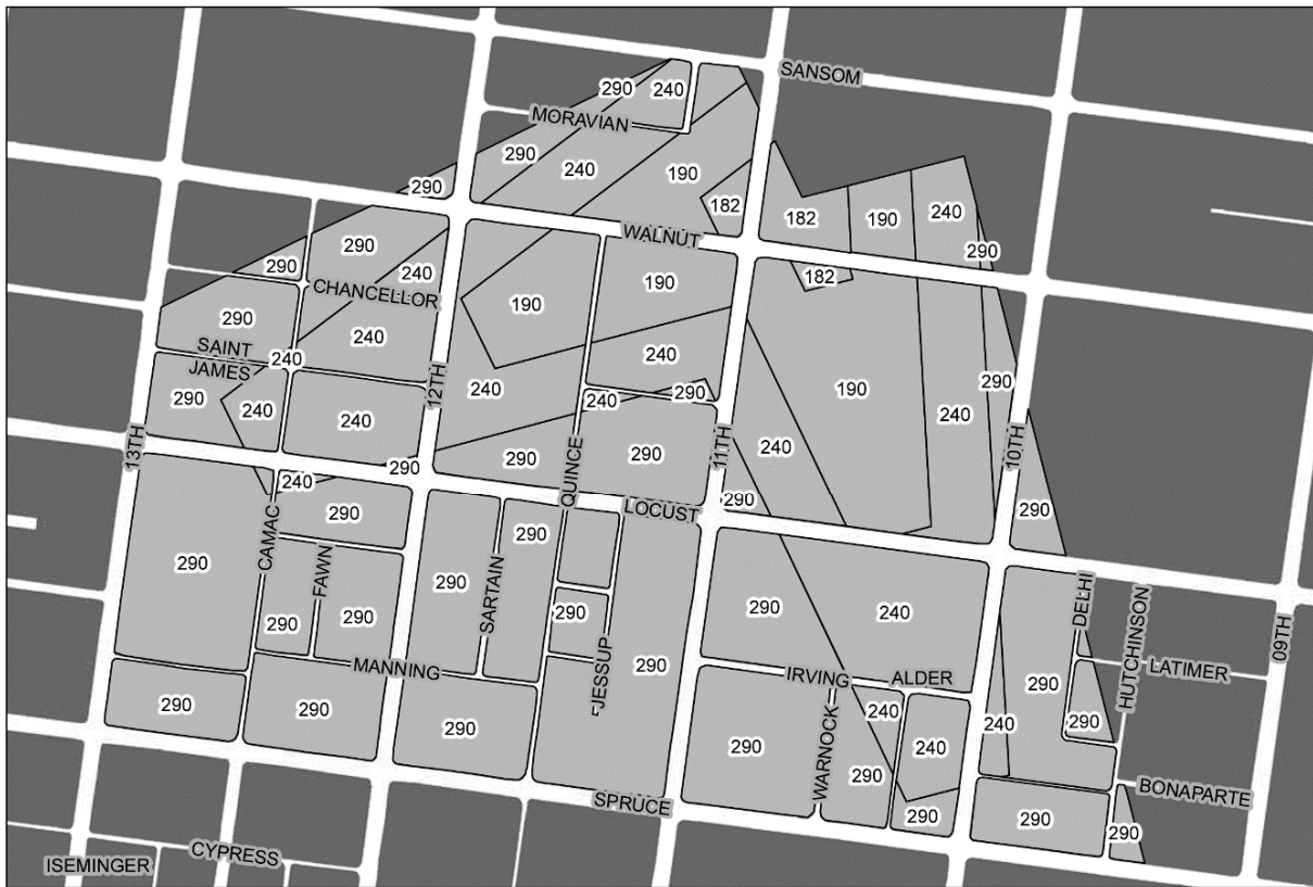
Heliport Hazard Area Map - Thomas Jefferson University Hospital Heliport Area

■ Heliport Hazard Area (maximum building height in feet)