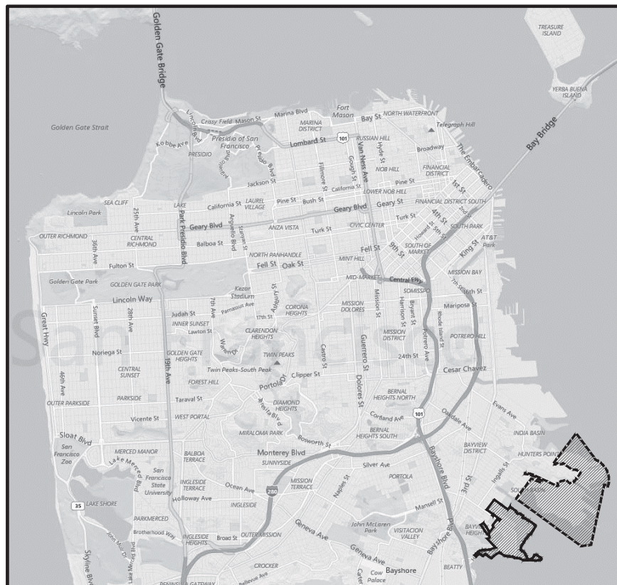
EXHIBIT C Map Demonstrating the Location of the Subject Property within the City and County of San Francisco (For Informational Purposes Only)

If any part of this initiative is held invalid by a court of law, or the application thereof to any person or circumstance is held invalid, such invalidity shall not affect the other parts of the initiative or applications which can be given effect without the invalid part or application hereof and to this end the sections of this initiative are separable.