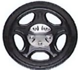
STANDARD PIU WHEEL